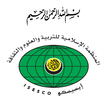
Islamic Educational, Scientific and Cultural Organization -ISESCO-

Rabat, Kingdom of Morocco 12-14 Zhul Qida 1427 A.H. / 4 - 6 December 2006