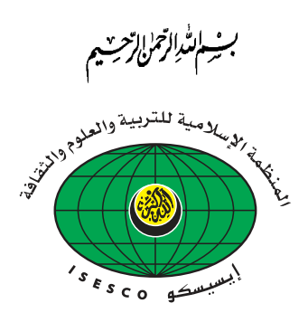
Islamic Educational, Scientific and Cultural Organization -ISESCO-