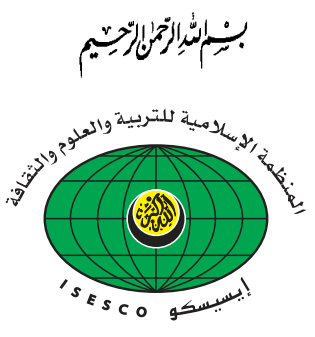
Islamic Educational, Scientific and Cultural Organization -ISESCO-

Rabat, Kingdom of Morocco 12-14 Zhul Qida 1427 A.H. / 4 – 6 December 2006