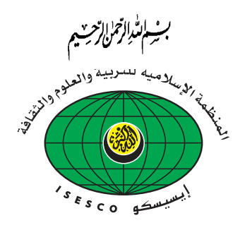
Islamic Educational, Scientific and Cultural Organization -ISESCO-

Rabat, Kingdom of Morocco 12-14 Zhul Qida 1427 A.H. / 4 - 6 December 2006