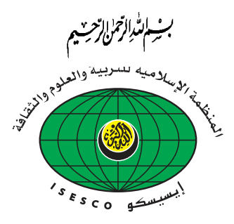
Islamic Educational, Scientific and Cultural Organization -ISESCO-

Rabat, Kingdom of Morocco 12-14 Zhul Qida 1427 A.H. / 4 - 6 December 2006