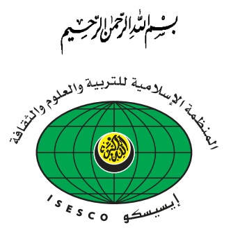
Islamic Educational, Scientific and Cultural Organization -ISESCO-