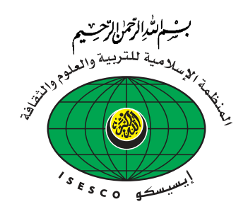
Islamic Educational, Scientific and Cultural Organization -ISESCO-

Rabat, Kingdom of Morocco 12-14 Zhul Qida 1427 A.H. / 4- 6 December 2006