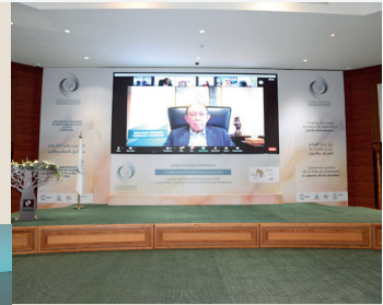
Tun Musa Hitam Former Deputy Prime Minister of Malaysia