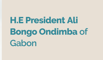
H.E President Ali Bongo Ondimba of Gabon