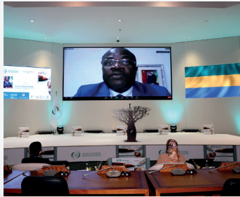
H.E Aisha Muhammadu Buhari, First Lady of Nigeria

They are personalities whose backgrounds, experience and achievements can inspire the candidates, while providing them practical advice on how to be a Leader and an Ambassador for Peace. The participation of the Inspirational Leaders allows to have an Intergenerational Dialogue on Peace, Gender based issues and Social Cohesion, below some inspirational Leaders during the 2021 LTIPS Edition.