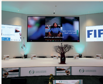
His Highness Muhammadu Sanusi II 14 th Emir of Kano and UN SDG Advocate Samoura Secretary General of FIFA